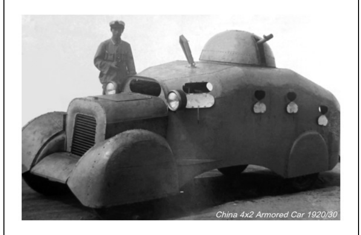
1935 Car, Armored, 4x2 Local Build Mod. 1935.