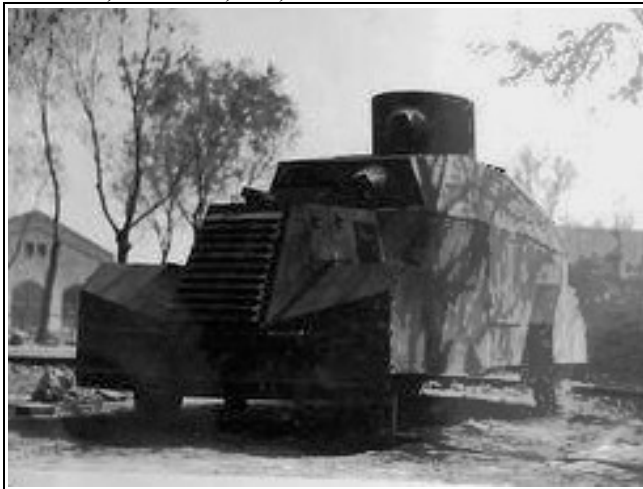
1932 Car, Armored, 4x2, Local Build Mod. 1932.