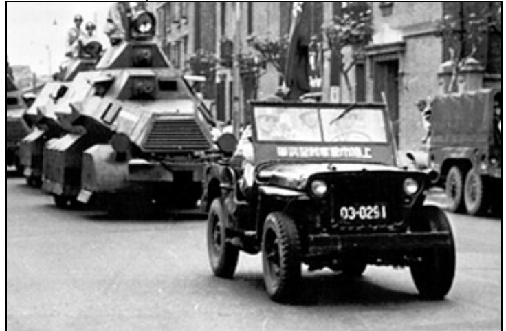
Above: One of many softsking support vehicles supplied by the U.S. To the Chinese Nationalist Army (photo circa 1949)