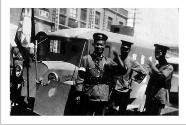
1928 Car, Armored, 4x2 General Feng No. 1.