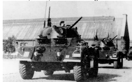
Above: 37mm cannon armed T17E1 Staghound during a post-WWII Parade.

Remarks: The Belgian Army had several T17E1s left over from World War II. With the shrinking of their overseas empire, at 30 of these were transferred to Lebanon during the 1950's (see US for vehicle details).