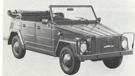
Above: Type 181 with soft-top and brush guards.

Remarks: An unknown number of VW Type 181 utility vehicles were acquired from West Germany for liaison work (see Germany for vehicle details).