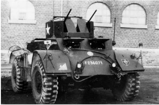
Above: One of the T17E2 Staghound AA vehicles issued to the Belgian Brigade for the return to mainland Europe.

Remarks: Originally meant as an anti-aircraft vehicle, the twin .50 caliber armed vehicle proved to be excellent for reconnaissance (see US for vehicle details).