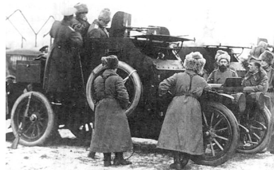
Above: Belgian MORS in Russia circa 1917.