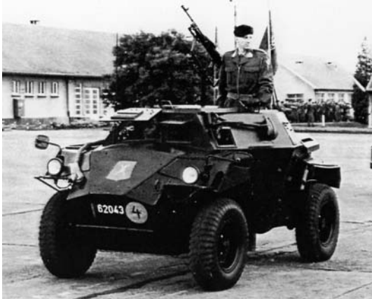
Above: Humber Scout Car Mk II during parade circa 1994.

1952 Car, Armd, 4x4, LFZ (Les Forges Zeebrugge).