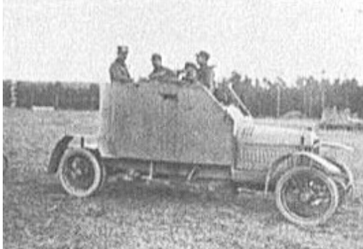
Above: Belgian Peugeot armored car, part of the Belgian "Corps des Autos-Canons-Mitrailleuses Russie".