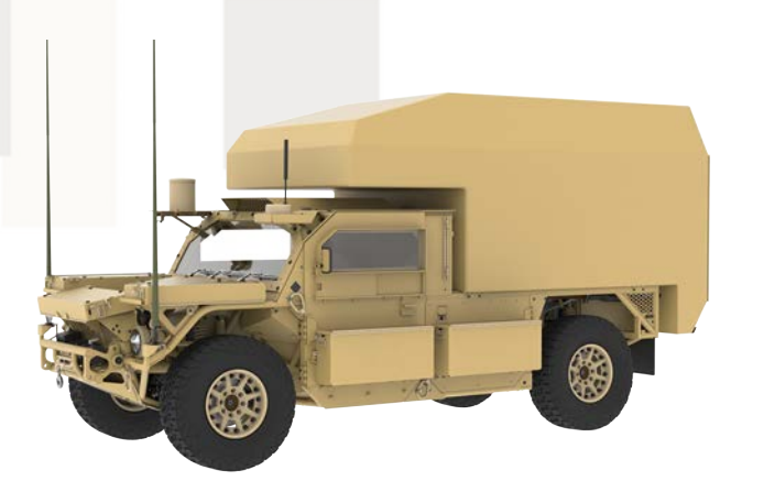
Shelter Carrier Kit