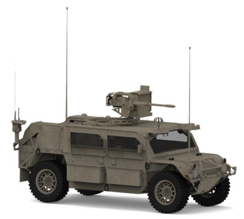
6-Man Light Reconnaissance Vehicle