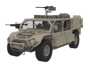
3-Man Long-Range Surveillance