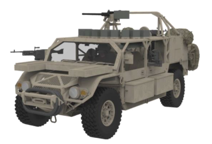
7-Man Airfield Seizure