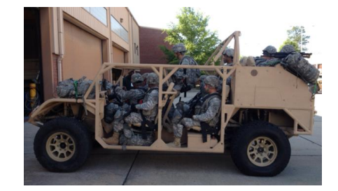
9-Man Army GMV XMI297