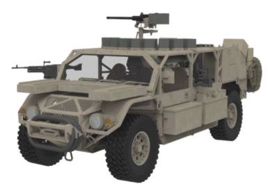
5-Man SOF Legacy